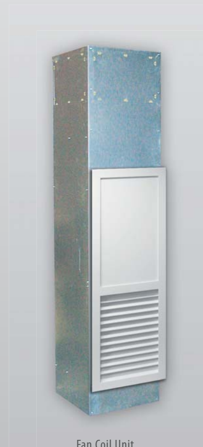
Fan Coil Unit

Our Designer Series is adaptable to any room scheme. IEC's wooden return air panels and grille frames are delivered primed with two coats of oil-based primer so painting is simple. Matching panels and grille frames to the interior color is easier than ever.